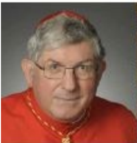
His Eminence Thomas Cardinal Collins Some Reflections by Cardinal Collins

Solemnity of Saint Joseph, husband of the Blessed Virgin Mary ROSARY 8:30 am, CONFERENCE 9am-4pm (EST)