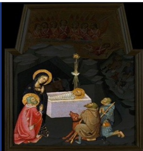
Workshop of Bartolo di Fredi, Adoration of the Shepherds

- Pope Francis – Christmas 2016 (Midnight Mass)