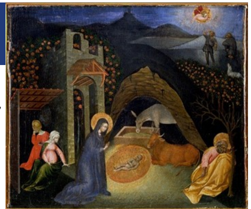
John of Paul (1395/1400 ca. 1482); Altar-step compartment: The Nativity and the Annunciation to the Shepherds

A splendid nighttime scene of the Nativity and the Annunciation to the shepherds, in which St. Joseph is depicted as an old man, shown from behind as he sleeps next to a dead tree, which alludes to his exclusion from the birth of the Son of God. The two women near Mary—who are the midwives of which the apocryphal gospels speak—represent those people who believe (the woman who looks toward the Virgin) and those who doubt (Salome, who turns her back). In the background an angel lights up the sky appearing to the shepherds. But the supernatural light which radiates from the Child, placed humbly on the ground, is much brighter.