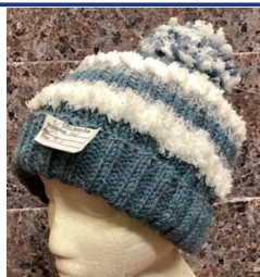
$8.00 Lady's grey/ green