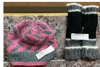
$12.00 Girls grey/ pink hat. $5.00 texting mitts