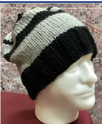
$10.00 Men's grey/black