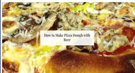
How to Make Pizza Dough with Beer