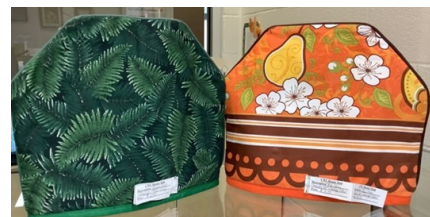
$4.00 each, tea cozies for smaller teapots