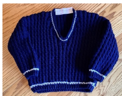
$20.00 toddler boy's pullover, 18 to 24 months

Know you are helping us help others with your support. If you see something you are interested in please contact Fran at fern0@rogers.com or call 905-867-7595 to learn more. Click HERE to see inventory.