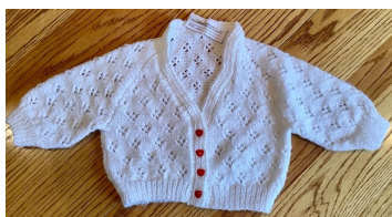
$10.00 baby's white cardigan, 12 months