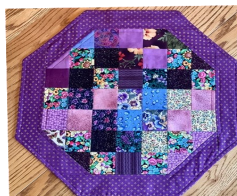
$20.00 floral/purple Octagon topper, 18" edge to edge