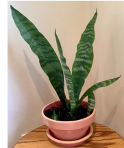
$8.00 Snake Plant