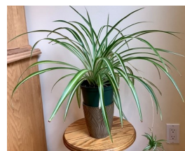
$10.00 spider plant, 6" pot, 22" total height