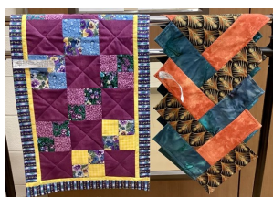
$22.00 each, table runners, left about 15" X 40", right 13 1/2" X 47"

This week the CWL has added some easy-care houseplants to our virtual bazaar pages! Have a look and see which might be nice additions to your indoor space. We also have some sewing to spruce up your table or dresser. Remember that all your purchases help the CWL with the various charities and good works they support. If you see something you are interested in contact Fran at 905-867-7595 or email fern0@rogers.com . Click HERE to see inventory.