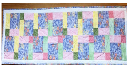
$35.00 pastel with blue floral runner, 54" x 15 1/2"