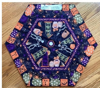
$20.00 Halloween topper 23" X 20"