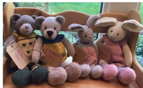
$30.00 each for Bears, $25.00 small Bunny, $30.00 large Bunny