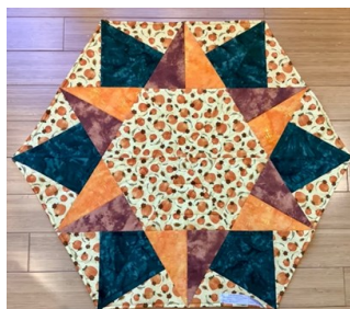
$45.00 Pumpkin/Autumn topper 30"