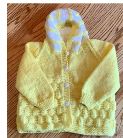
$18.00 hooded child's size 2