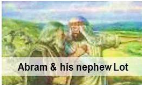
Abram & his nephew Lot

The Greek for "brother" is "adelphos" which could also mean "relatives", "fellowman" & "countryman". In the Bible, there are several passages where the term "brother" was used not for biological siblings.