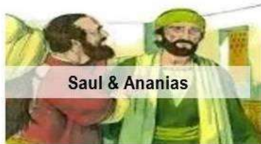
Saul & Ananias

2Sam.1:26 "I am distressed for you my brother Jonathan" But Jonathan is only a friend of David.