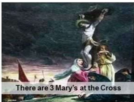
There are 3 Mary's at the Cross

In the Bible, there were three Mary's who followed Jesus to his crucifixion- Mary the Mother of Jesus, Mary Magdalene, and Mary the Mother of James & Joseph (Mat.27:56). This other Mary (mother of James & Joseph) was a relative of the Virgin Mary. Therefore, Jesus Christ and James & Joseph are actually relatives (not biological brothers). Their mother's name are only the same – Mary.