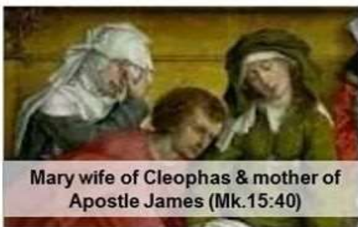
Mary wife of Cleophas & mother of Apostle James (Mk.15:40)

Jn.19:25 KJV "Now his mother (Virgin Mary), and the sister of his mother, Mary the wife of Cleophas & Mary Magdalene, near the cross".