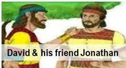
David & his friend Jonathan

"...and also brought again his brother Lot." But Lot is only a nephew of Abraham.